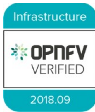
Figure 2.4: NFVI badge

The below figure shows the targeted badge for NFVI.